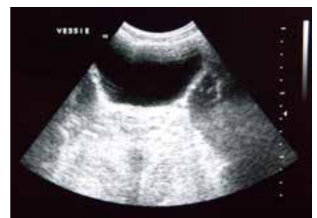
FIG 1. BLADDER ON SCREEN

A normal ultrasound scan of the bladder of a 31-year-old woman