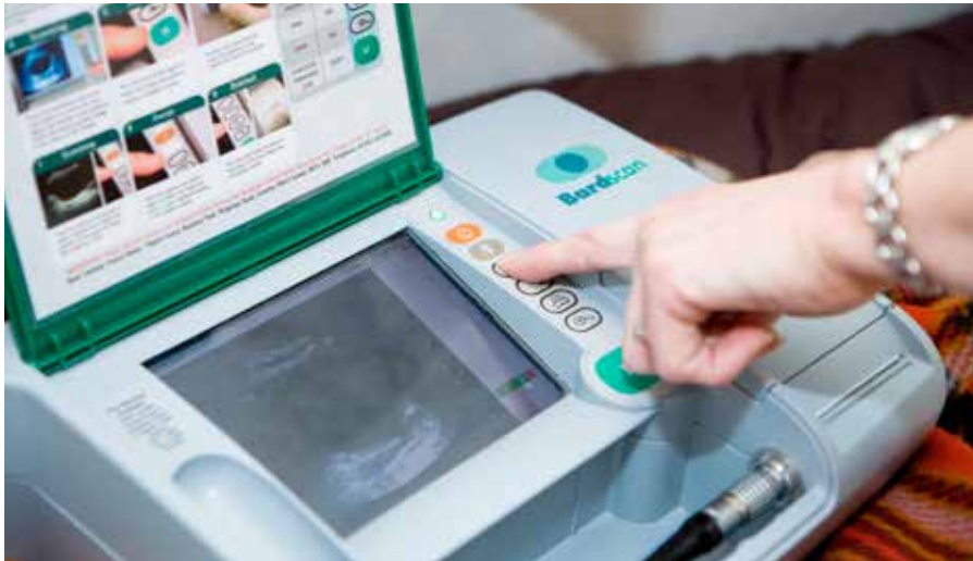
FIG 2. PORTABLE BLADDER ULTRASOUND

A portable bladder ultrasound scanner being used by a district nurse in a patient's home