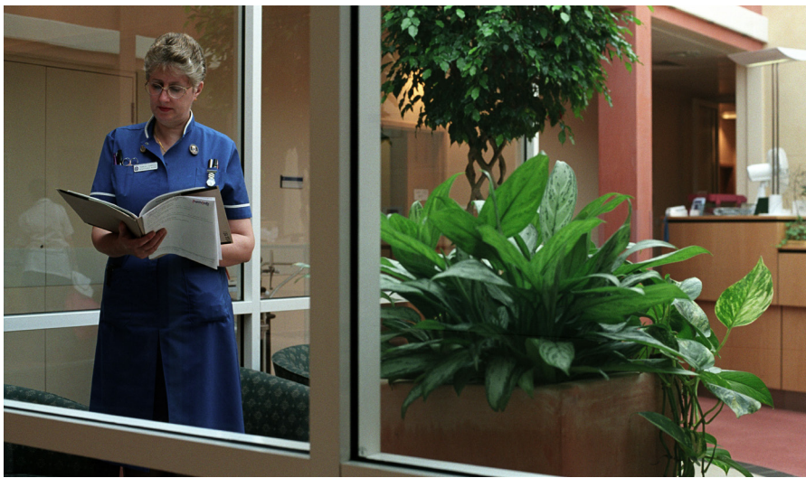
Academics and practitioners must help nurses explore and articulate their knowledge

resolve this dilemma is for practitioners and academics to form a partnership and narrow the gap between their conflicting interests. This entails the nursing profession helping academics meet the demands placed upon them by their employers in ways that are more creative and in greater accord with the values of nursing.