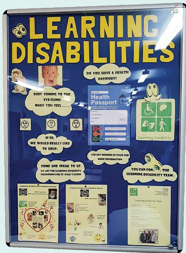
Fig 2. A ward learning disabilities noticeboard

want to be supported and whether they need reasonable adjustments. Health and social care professionals can use the profiles to find out, at a glance, what support needs service users have.